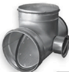
Version for actuator assembly TSHFL-DTBL